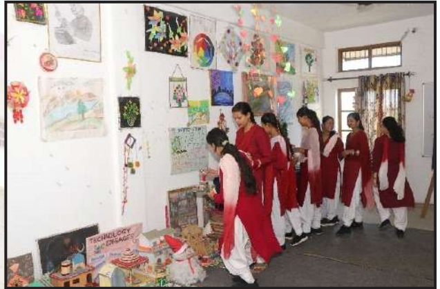
Art & Craft Resource Center