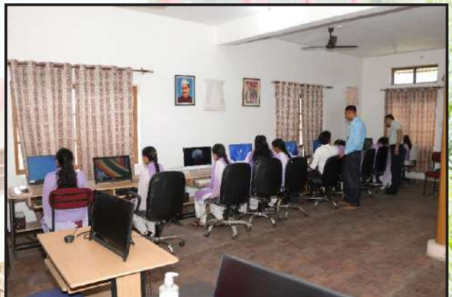
Information & Communication Technology (ICT) Resource Centre