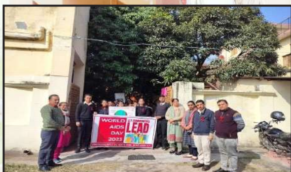
Rally on World AIDS Day