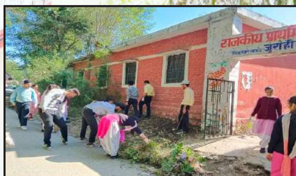
Swachhta Abhiyan Mission