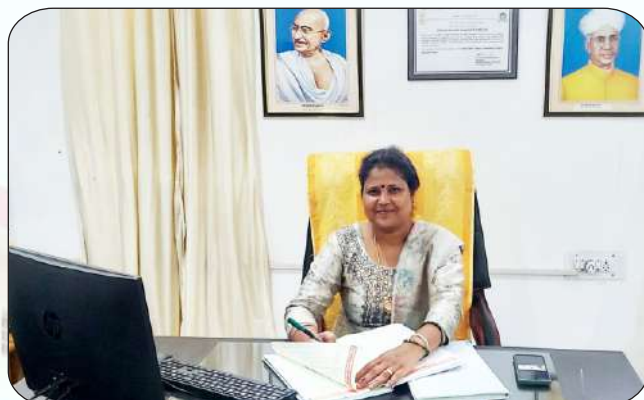
Principal of R.C. College