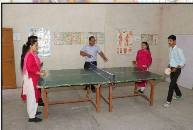
Health and Physical Education Resource Centre