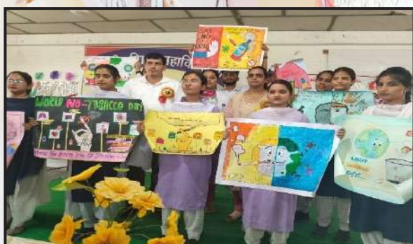
Poster Making Activity on No Tobacco Day