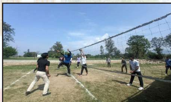
Annual Sports Meet