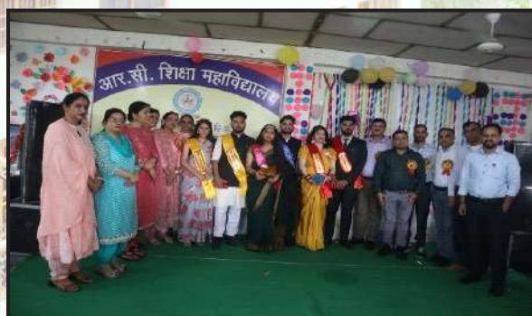
Farwell Party B.Ed.